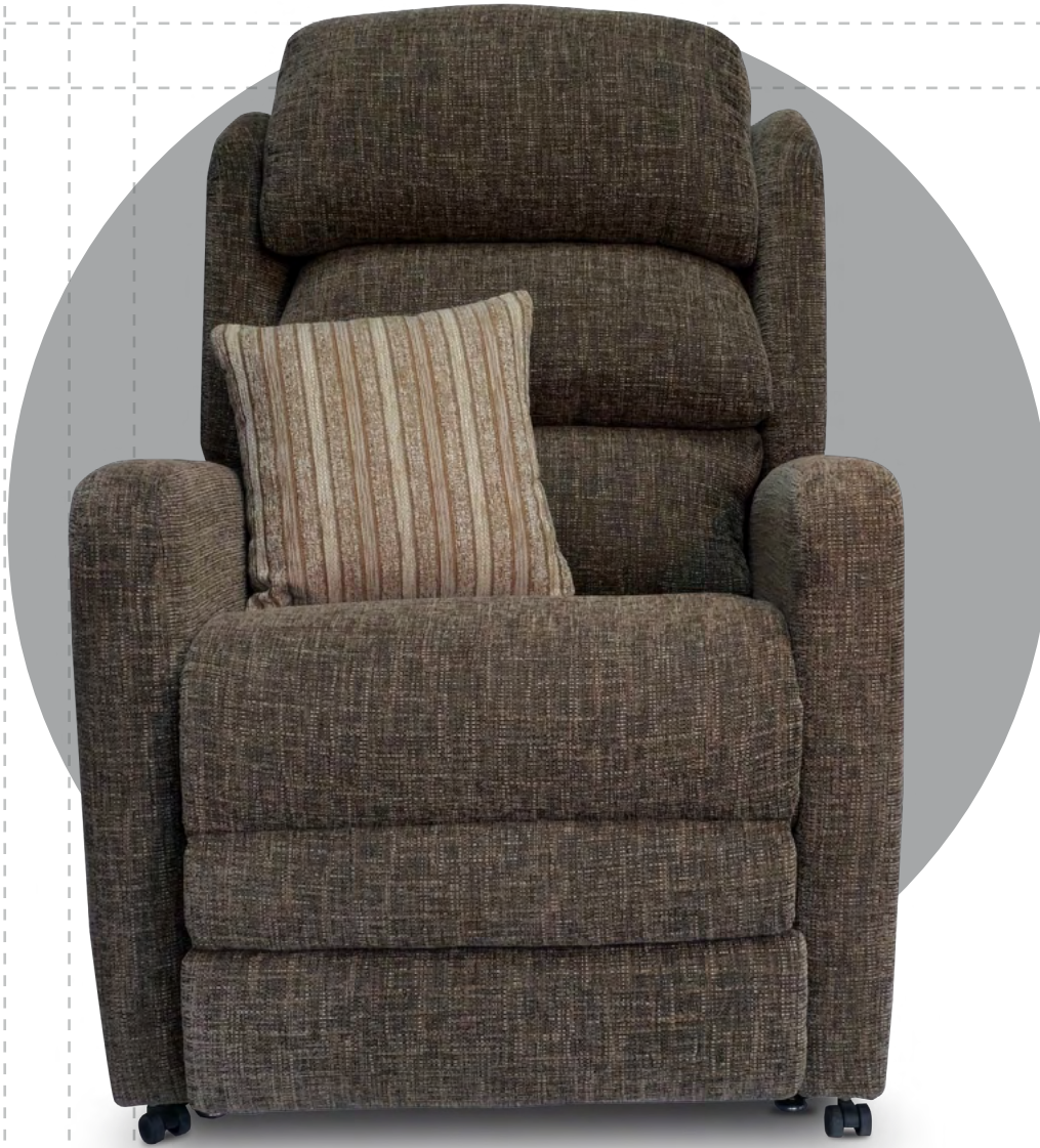
Image features the Camberley Deluxe mechanism in Toffee fabric.